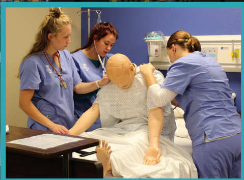
Associate Degree Nursing students at WITC-Ashland getting hands-on practice in the new High Fidelity Simulation Lab. Students use computerized mannequins to simulate real-life scenarios.

The times they are a-changin', and so is WITC.