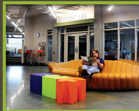
Rice Lake's "The Hub" features a full-service kitchen, casual seating, a fireside room for relaxing and a new Student Life Center.