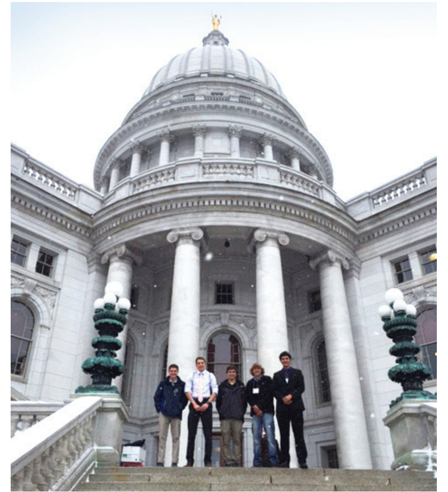
A group of the Welding Academy students traveled to Madison for a statewide event that features work by two-year college students. They talked with legislators and the lieutenant governor about their education and unique opportunity to earn college credits while still in high school.

Additional success is also noted in that WITC expanded the concept to more than just welding students. This year inaugurates a Dual Enrollment Academy effort with a construction emphasis at Clayton High School and another similar effort developing for the near future with a health industry emphasis.