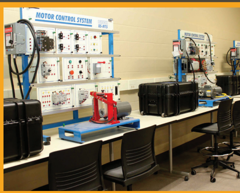
Electrical circuit boards in the improved Industrial Maintenance lab in Superior.

Contact your local admissions advisor to schedule a campus tour or classroom shadow to check out our new, state-of-the-art facilities and classrooms.