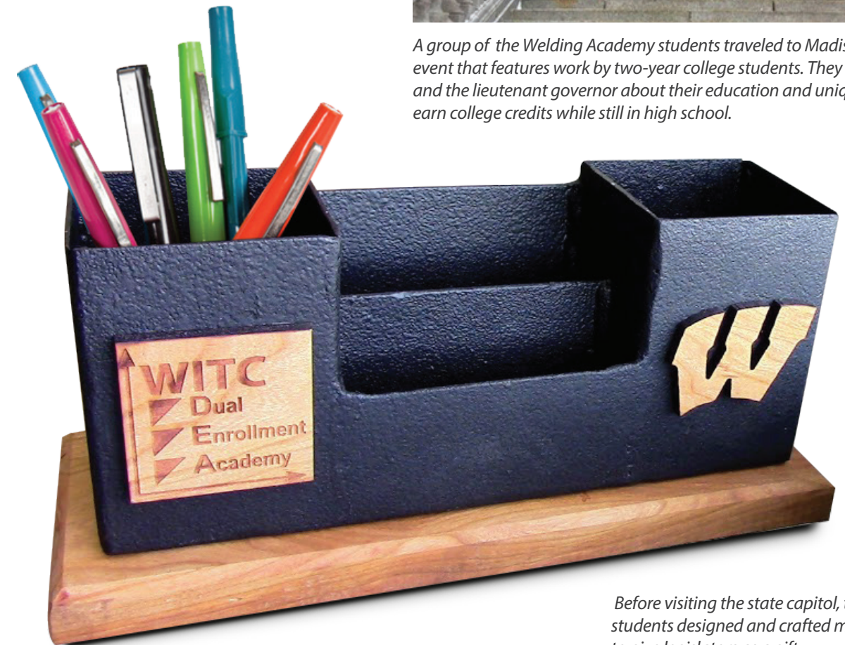
Before visiting the state capitol, the Welding Academy students designed and crafted metal pen/pencil holders to give legislators as a gift.